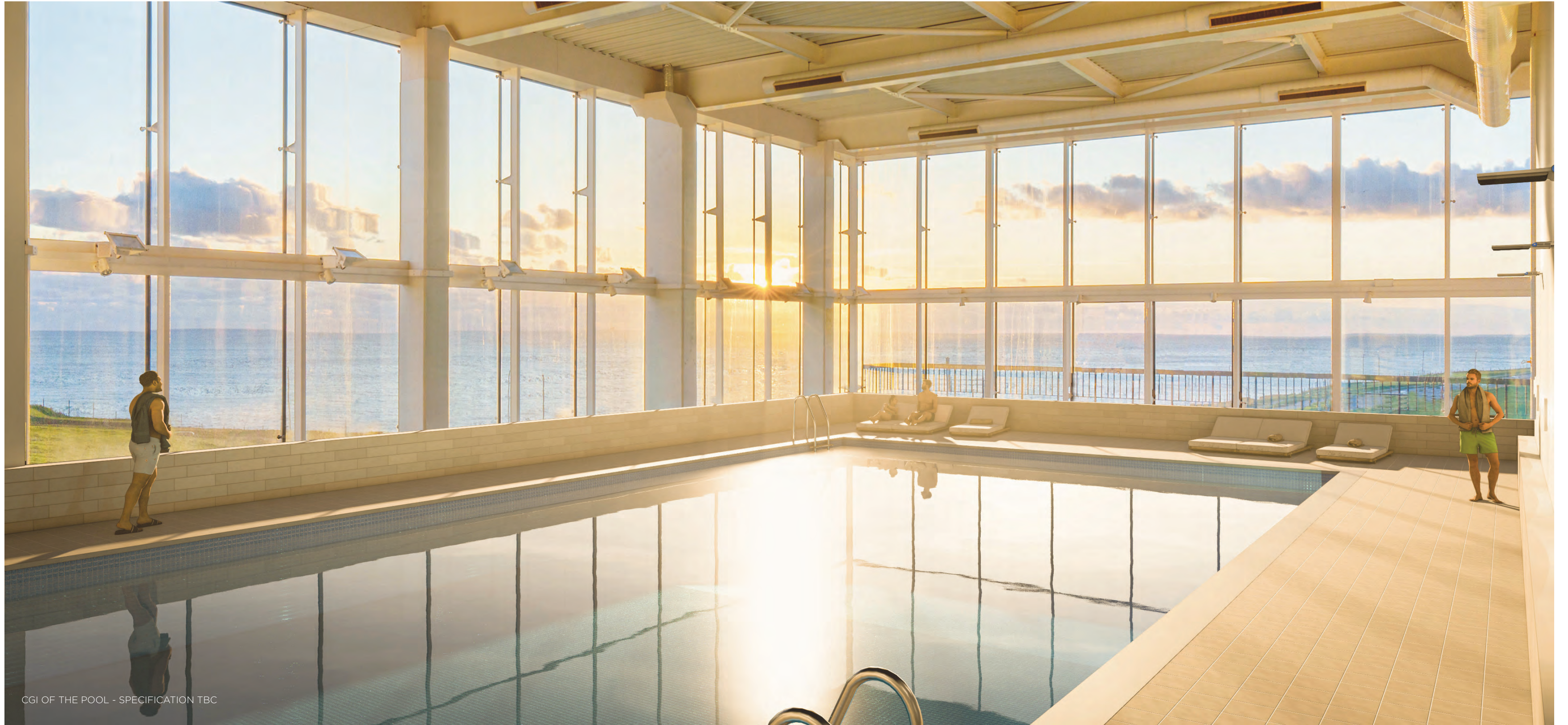
CGI OF THE POOL - SPECIFICATION TBC