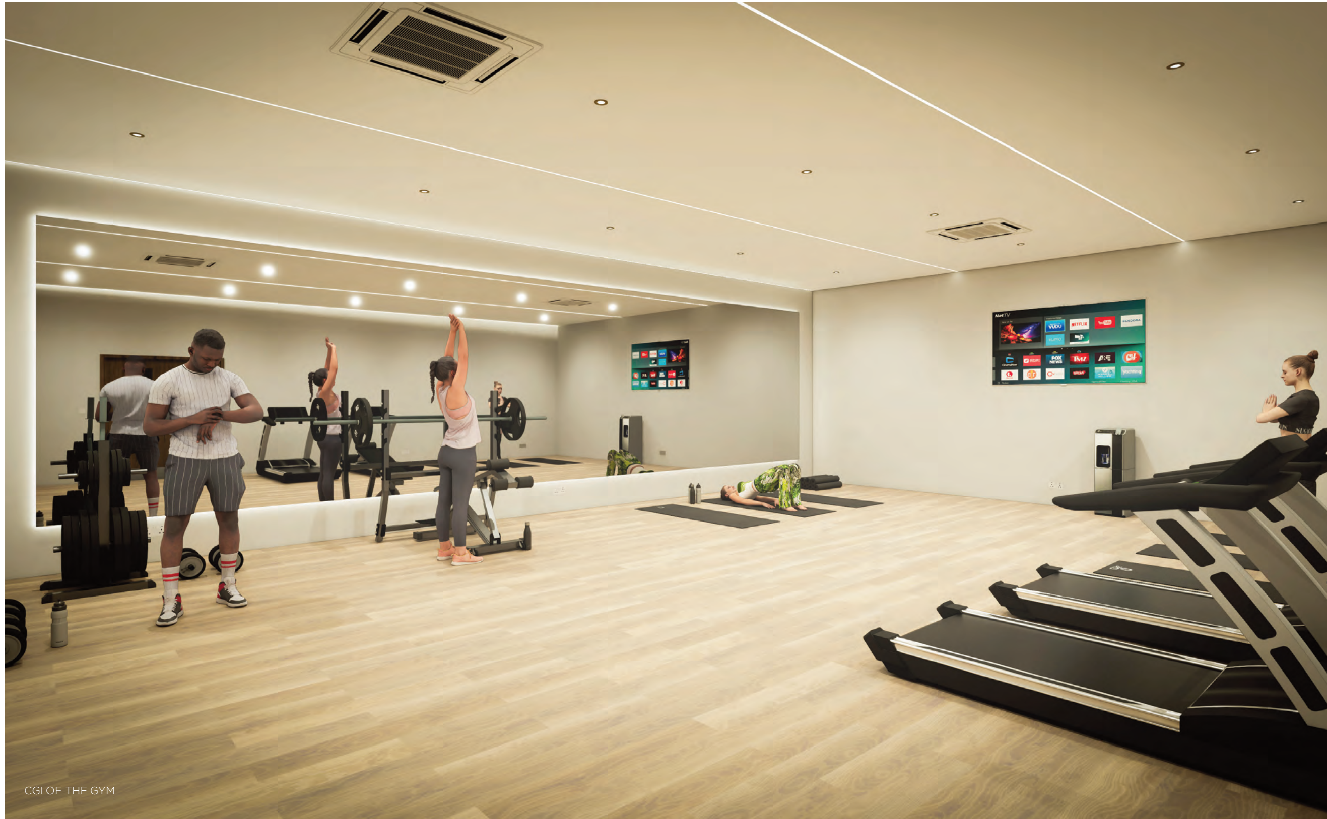
CGI OF THE GYM