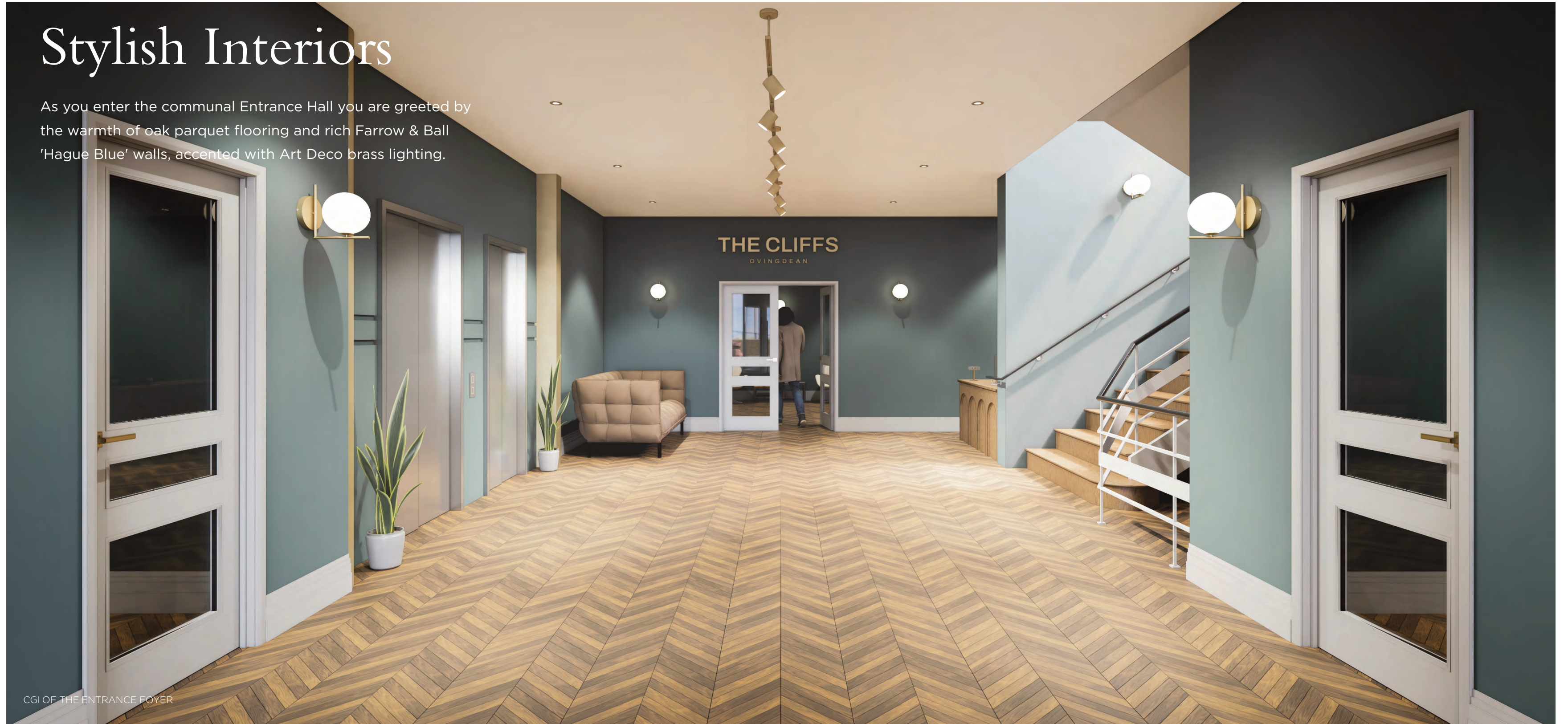
CGI OF THE ENTRANCE FOYER

As you enter the communal Entrance Hall you are greeted by the warmth of oak parquet flooring and rich Farrow & Ball 'Hague Blue' walls, accented with Art Deco brass lighting.